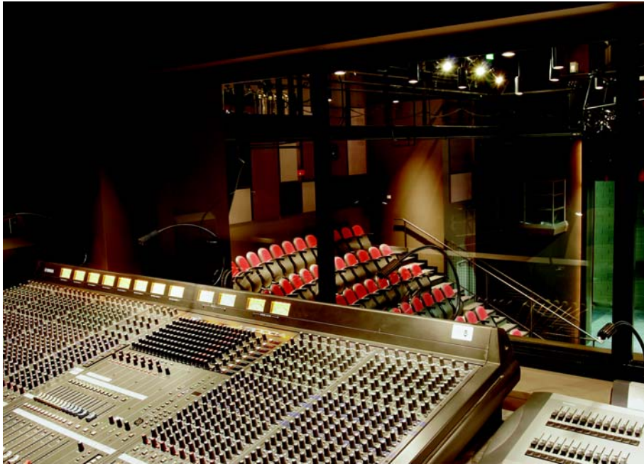
Control Booth in University Theatre.